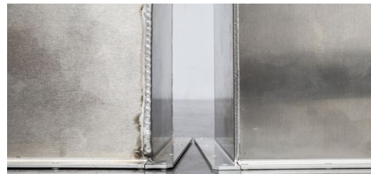
Werner Neumann's expectations in regard to the reduction in retouching work were satisfied completely by laser welding. For some parts the touch-up time could be reduced from twelve hours to just 90 minutes.