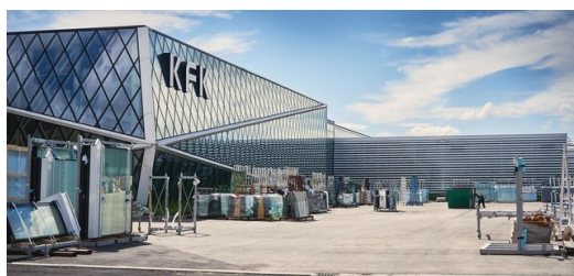
The KFK building in Croatia.

KFK used to focus predominantly on customers from Croatia, but today the company is involved in projects all over the world. "Right now we're focusing on the UK, which is currently experiencing a boom in construction. All the world's big cities are constantly striving to make buildings that are taller, more sophisticated and even better quality, and London is no exception," says Papac. He is particularly proud of the biggest project KFK is working on at the moment: "It's a residential building in London, the tallest structure of its kind currently under construction anywhere in Europe. With 76 floors and at 233 meters tall, it's a project that obviously requires the production of lots and lots of facade modules." It takes several years to complete projects on this scale – three and a half years in this case.