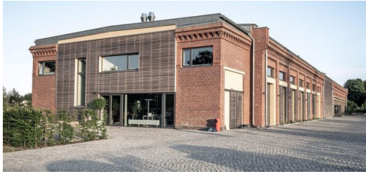
The Potsdam-based company Miethke produces high-tech medical devices that are implanted in people's brains and bodies.

That sparked his interest in the whole issue of surfaces. "Right now we're experimenting with ways of using the laser to create hydrophobic and hydrophilic surfaces on our parts. It seems that once you get hold of an ultrashort pulse laser, you are constantly finding new things you can do with it!"