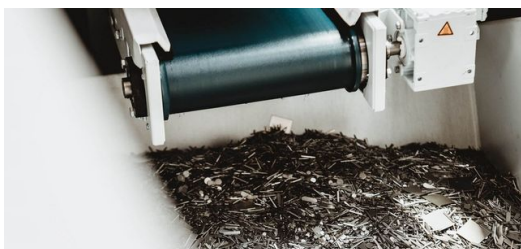
Material-saving: The TruPunch 5000 reduces rejects to a minimum.