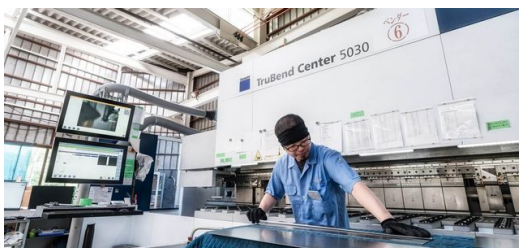
<p>An employee working with the <a href="https://www.trumpf.com/en_INT/products/machines-systems/bending-machines/trubend-center-series-5000/">TruBend Center 5030</a>. This is how the "Orisu" chair is made.</p>

KANEYOSHI manufactures Ishida's design with TRUMPF machines. This offers advantages: "On TRUMPF machines, I can use different manufacturing processes within a short time. This allows me to finish the product faster," Yoshida explains. The production of the chair shows what the KANEYOSHI company is capable of: First, lasers cut uniform components from sheet metal. When bent in the right places and welded together, these components finally make up the finished object like puzzle pieces. The designer and Yoshida choose the material quite deliberately: "Unlike wooden products, sheet metal has the advantage that its strength can be increased simply by bending it. So we don't need any additional components to assemble the chair. This saves material and weight," explains Ishida.