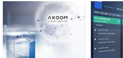
Some of the data is uploaded to the AXOOM Cloud via the Internet.