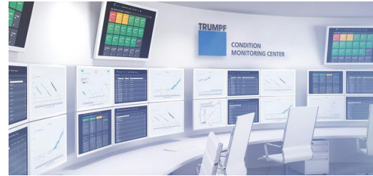
Algorithms and real TRUMPF experts then set to work transforming the data into trend analyses.