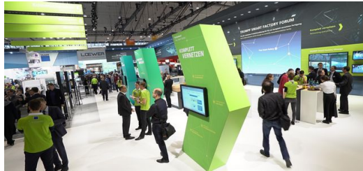
Thanks to the green T-shirts of the TruConnect consultants, visitors who had questions about the TRUMPF solutions for the Smart Factory quickly found what they were looking for.