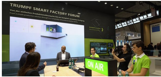
From consulting services to automation to fully digitally networked production - four TRUMPF experts answer questions from moderator Chris Brow.