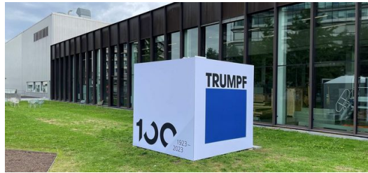
<p> _____ </p>