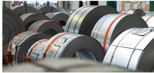
A new coil warehouse is also being built at the SCHRAG site in Seevetal, and it will supply material to both the roll-forming line and the press line.