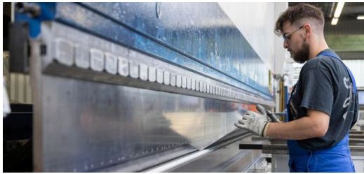
Automation reaches its limits in the production of special profiles. At SCHRAG, they will continue to be processed by bending professionals on bending presses. At SCHRAG's Hamburg Seevetal location, a 12.5-meter press from TRUMPF completes the existing press line.

consultants, underpinned by profitability calculations and the jointly developed fact base, convinced us all. "