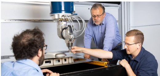
Discussing, arguing and seeking solutions together: the good cooperation between sons and father has taken the company a long way, on course for the Smart Factory.