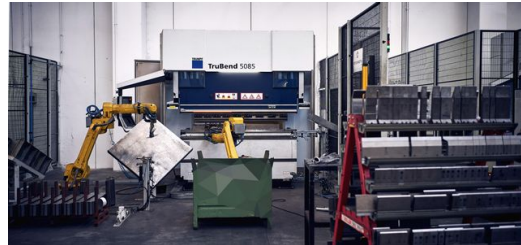
<p>Robot colleague: For the employees at Omas S.p.a., robots have long been part of everyday life.</p>