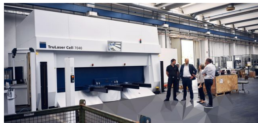
<p>The TruLaser Cell 7040 in the production hall of Omas S.p.a.</p>