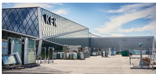
The KFK building in Croatia.

KFK used to focus predominantly on customers from Croatia, but today the company is involved in projects all over the world. “Right now we’re focusing on the UK, which is currently experiencing a boom in construction. All the world’s big cities are constantly striving to make buildings that are taller, more sophisticated and even better quality, and London is no exception,” says Papac. He is particularly proud of the biggest project KFK is working on at the moment: “It’s a residential building in London, the tallest structure of its kind currently under construction anywhere in Europe. With 76 floors and at 233 meters tall, it’s a project that obviously requires the production of lots and lots of facade modules.” It takes several years to complete projects on this scale – three and a half years in this case.