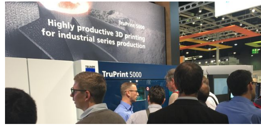
A highlight of the trade fair is the TruPrint 5000 - the interest of the visitors is great.