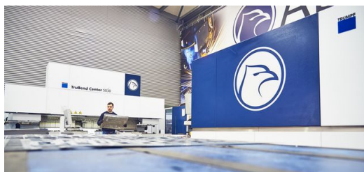
Most up-to-date technologies: Worker with the TruBend Center 5030