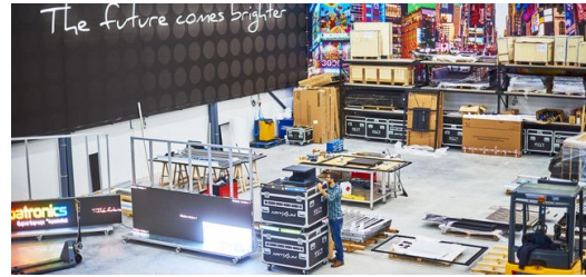
Tailor-made: Apametal develops and builds each digital sign itself.