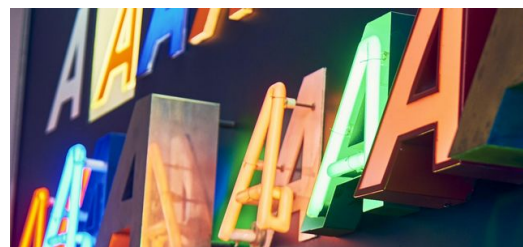
The secret to Apametal's success: a mix of technology and creativity