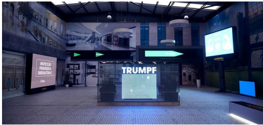
Authentic: Cobblestones in the showroom help provide an authentic atmosphere.