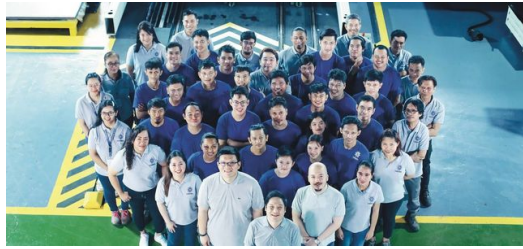
& Cherimel & &

2000 & Cherimel & 5,000 & TruLaser 3030 & TruPunch 5000 & TruBend Center 5030 & TruBend 3100 & TruBend 7036 & 2024 & 2 & TruBend 5170 & Cherimel & Cu & ISO & AS & Cherimel & & &