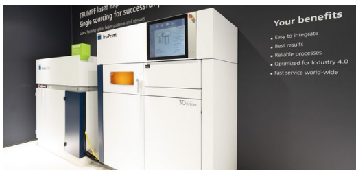
<em>TRUMPF prints copper and gold with a new green laser</em>

For another first at Formnext, TRUMPF printed pure copper and gold using a green laser. The company's developers achieved this by linking the new TruDisk 1020 disk laser and TruPrint 1000 3D printer. The former's wavelength is in the green spectral region, and unlike infrared lasers, it is able to weld highly reflective materials such as pure copper and gold. None of the expensive material goes to waste, which the jewelry industry is sure to appreciate. And the electronics and automotive industries benefit from components made of pure copper, an excellent conductor of electricity and heat.