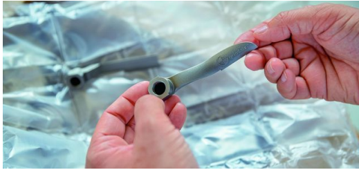
All one piece: Redesigned by Bionic Production, this nozzle offers gentle curves straight from the 3D printer.

The new nozzle is efficient in many different respects. The flow of coolant has been optimized, reducing pressure losses by up to 20 percent. That means you need a lower pressure - and less energy - to achieve the specified coolant exit velocity. The curved channels and optimized jet trajectory take the lubricoolant to the precise place it is needed, delivering no more and no less than is required to carry out the process in an optimum manner without causing thermal damage to the part. This reliable and automated solution for delivering lubricoolant eliminates factors that may have previously caused hold-ups in the manufacturing process.