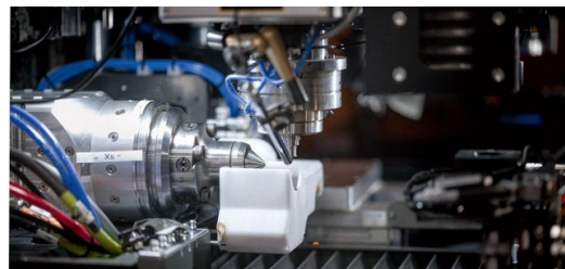
The principle of laser rotation: (to the left) the air-bearing rotational axis that holds the workpiece; the trepanning unit works from above. The workpiece rotates at a speed of 3,500 rotations per minute, where the focus circles are 30,000 times per minute.