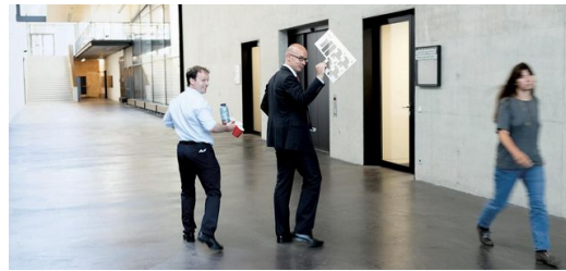
The team of people from the product group, development, purchasing, production, sales, service and project organization departments meets at regular intervals to discuss how development on the TruLaser Center 7030 is progressing.