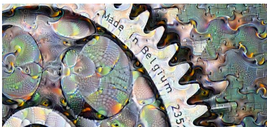
The dream in the workpiece?