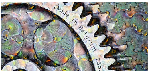
The dream in the workpiece?