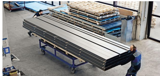
Specialized: Although BIGSTEEL AG produces small sheets and custom products, this metalworking firm also processes large-format sheet metal components.