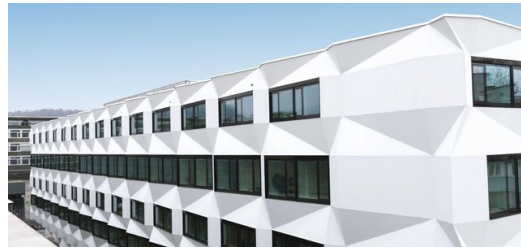
As painted: The facade of the University of Lucerne comes from BIGSTEEL.