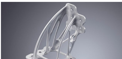
Lightweight construction: Weight reduced mounting brackets are

We started working on selectively fusing metals, what we now call Laser Metal Fusion (LMF), in 1999 together with the Fraunhofer ILT. We used the experience we gained from this to develop our first LMF machine—the TrumaForm. The machine was introduced to the market in 2003, which was pretty early in the game for industrial additive manufacturing solutions. Unfortunately, it was a bit ahead of its time. The market was still heavily focused on research and development applications, as well as a few niche applications, so we set further development aside for the time being.