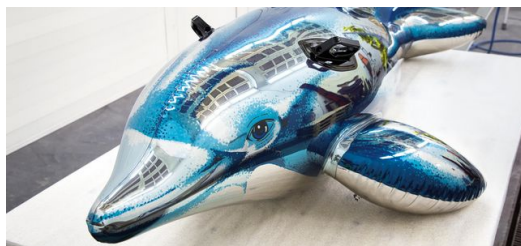
This dolphin will not be found in the water, but rather in a museum.

But of course! When the artist approves the objects we have created in our shop, he also offers a word of thanks to the staff involved. This personal recognition for their work is something they otherwise experience only very rarely. And I get goosebumps every time an artist sees his idea brought to fruition and — with a quiet "Wow!" — expresses his excitement. But actually, every customer who is satisfied with our work is a source of pride.