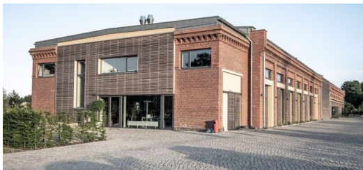
The Potsdam-based company Miethke produces high-tech medical devices that are implanted in people's brains and bodies.

That sparked his interest in the whole issue of surfaces. "Right now we're experimenting with ways of using the laser to create hydrophobic and hydrophilic surfaces on our parts. It seems that once you get hold of an ultrashort pulse laser, you are constantly finding new things you can do with it!"