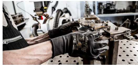
Kempf’s managing directors used success bonuses to encourage their employees to identify parts suitable for automated laser welding. This boosted their motivation, and now even fixture construction is easy.