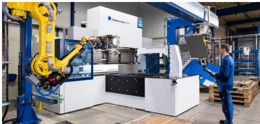
<p>The new TruBend Center 7020 panel bender made production of the field stove possible in the first place. Only with this equipment was the team at Kuipers able to automatically bend the relatively large firebox of 333 millimeters. </p>