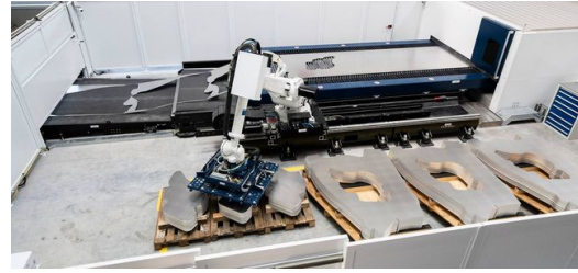
Laser blanking: A robot automatically sorts the cut components.