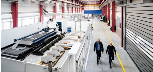
The 34 meter-long laser blanking system from TRUMPF saves unprocessed material and around 4000 tonnes of CO 2 per year.