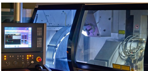
With the TruLaser Tube 7000 the tube specialists of ProfilaseRichter have opportunities that many customers don't even know, yet. Examples are bending connections and also positioning aids with locating pins and cut-outs to simplify assembly. Thanks to the degree of automation in the machine the throughput times are shorter and so are the delivery times.

We have weld seam detection, which is certainly worthwhile when executing higher piece counts in automatic operation – and adaptive clamping devices so that we can machine open profiles. One major topic is minimizing slag spattering in circular profiles and we achieve this with the spatter guard protection. A LoadMaster makes sure that the loading process is reliable and it goes without saying that machining causes very little marring.