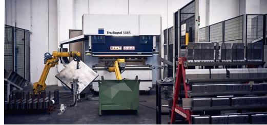
<p>Robot colleague: For the employees at Omas S.p.a., robots have long been part of everyday life.</p>