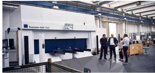
<p>The TruLaser Cell 7040 in the production hall of Omas S.p.a.</p>