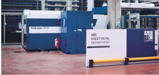
The TruLaser 3030 fiber 2D laser-cutting machine laid the foundations of AEC Illuminazione's close partnership with TRUMPF. Its connection to an automated storage system made production much faster.

achieve this, Bianchi has now connected up 85 percent of the company's machines. The MES generates production schedules and ensures smooth operation of the manufacturing environment. The design engineers can send their CAD drawings straight to the machines, where the data is imported and turned into finished parts as and when they are needed. The MES also collects machine data and key metrics for quality monitoring, machine utilization and production status. "By connecting everything together, we've created a truly transparent production environment. Tailoring our production schedules to the needs of our employees and machines helps to shorten throughput times and improve on-time delivery over the long-term," says Bianchi.