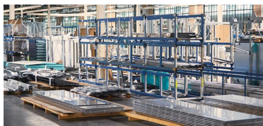
<p>A one-stop service provider: KFK set up its own glass production facility measuring approximately 360 meters long in 2017.</p>