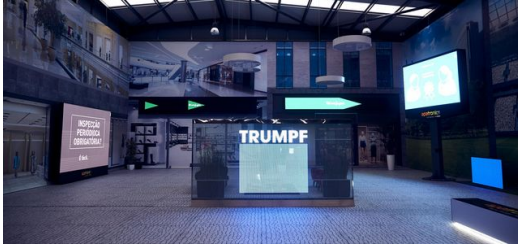
<p>Authentic: Cobblestones in the showroom help provide an authentic atmosphere.</p> – Frederik Dulay-Winkler