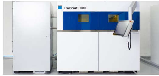
-The 3D printer - here the TruPrint 3000 from TRUMPF, prints the component layer by layer.