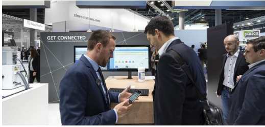
<em>All 3D printers at the exhibition stand were connected to a digital MES</em>

learn how much it will cost to produce the component and how long delivery will take. On top of that, the manufacturer can access the printers and the pending jobs' process data from anywhere in real time.