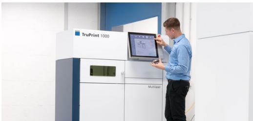
TruPrint 1000: TRUMPF's TruPrint 1000 3D printer