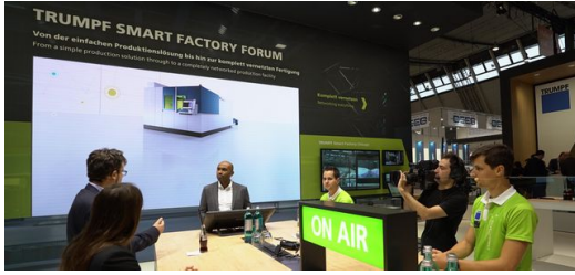
From consulting services to automation to fully digitally networked production - four TRUMPF experts answer questions from moderator Chris Brow.