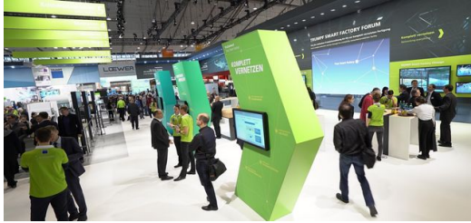
Thanks to the green T-shirts of the TruConnect consultants, visitors who had questions about the TRUMPF solutions for the Smart Factory quickly found what they were looking for.