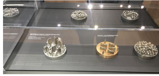
<p>Substrate plates with 3D-printed dental prosthesis.</p>