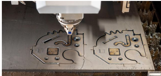
An employee removes a component with chamfers from a standard TRUMPF machine for laser cutting.