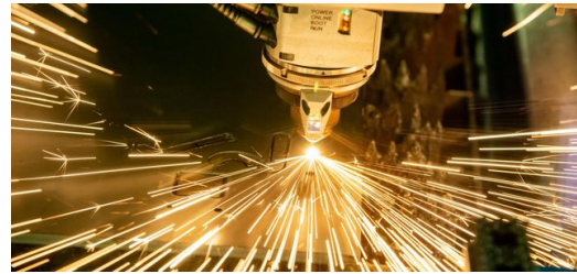
With EdgeLine Bevel technology, a TRUMPF standard machine for laser cutting produces beveled cutting edges on the contours of the component.