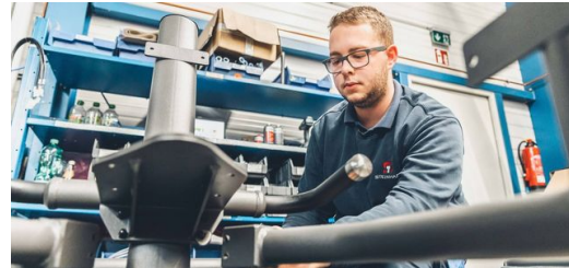
The frame of an EGYM exercise machine consists of primarily oval steel tubes. After processing on a TRUMPF laser tube-cutting machine, it is given an elegant dark gray finish by powder coating.