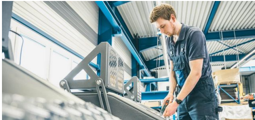
The TruMatic 7000 cuts and shapes the aluminum checker plates for the EGYM units scratch-free and in top quality.

70% of the frame of the unit consists of visually attractive oval tubes made of sturdy mild steel. "We use both our TruLaser Tube 5000 and our TruLaser Tube 7000 for processing. Both are equipped with the bevel cutting option and can insert threads." What would normally take several work steps to implement in conventional manufacturing, TRUMPF's laser tube-cutting machines accomplish in just one operation. The aluminum checker plate for placing the legs comes scratch-free from the TruMatic 7000 , and the TruBend 7036 Cell takes care of the necessary bending edge for fastening to the frame. The electronics and some plastic parts are supplied to Steinhart. After the frames are powder coated, all components are assembled into complete units.