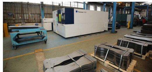
JBM has been using the TruLaser 1030 laser machines for sheet metal cutting for several years.