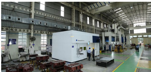
Originally bought for prototyping, JBM is using the TruLaser Cell 7040 now to process parts made of high strength steel.