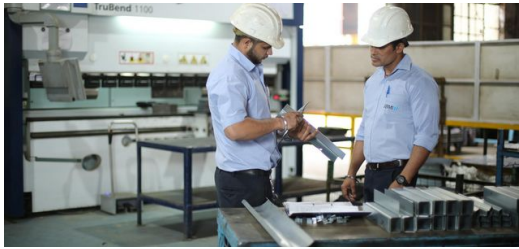
Quality guaranteed: Engineers at JBM are inspecting the parts made with the TruBend 1100 press brake.