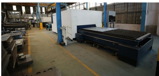
Lightweight doesn't always need high strength steels: JBM uses this TruLaser 1030 to produce profiles for buses.