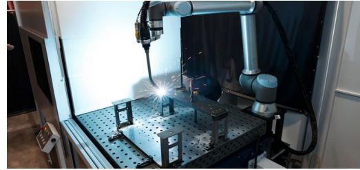
The automated welding cell that is easy to program, has many parameters already integrated and at the same time meets high quality standards: the TruArcWeld 1000 from TRUMPF.