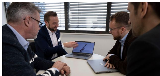
<p>The MultiFocus optics developed by TRUMPF especially for BENTELER produce outstanding results in the pore-free, gas-tight welding of aluminum in combination with BrightLine Weld.</p>