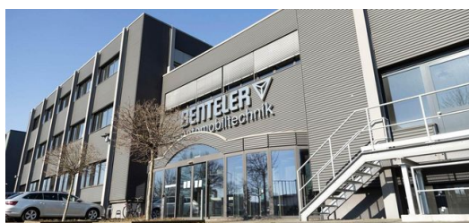
BENTELER is a fourth-generation family business, with headquarters in Paderborn, Germany. In its Automotive Division, this metal process specialist develops, produces and sells safety-relevant products, systems and services for the automotive industry.