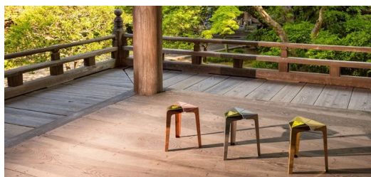
The "Orisu" chair is something special: it makes abstract technologies visible to the viewer.