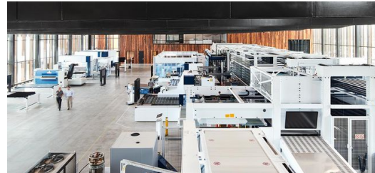
In a production hall measuring 55 meters in length, there is a connected sheet metal production with a central storage system as the centerpiece, which supplies the machine tools with material.