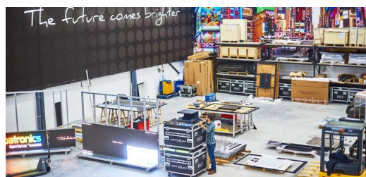
<p>Tailor-made: Apametal develops and builds each digital sign itself.</p> – Frederik Dulay-Winkler