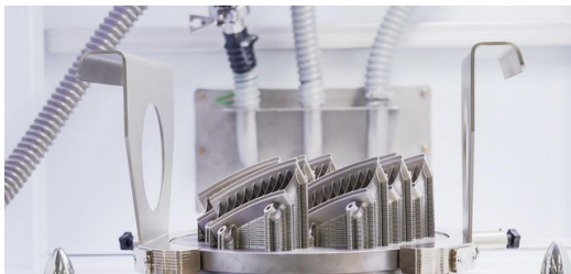
Done and dusted! A finished part from the 3D printer.