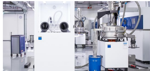
The excess powder is channeled from the unpacking station (left) to the sieving station. This unit cleans the excess powder so that it can be reused. It does this by removing the smoke residue and dirt particles picked up by the powder during the welding process.