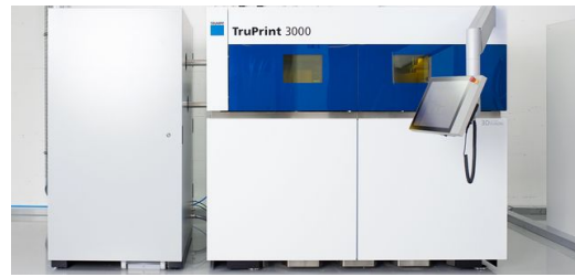
-The 3D printer - here the TruPrint 3000 from TRUMPF, prints the component layer by layer.