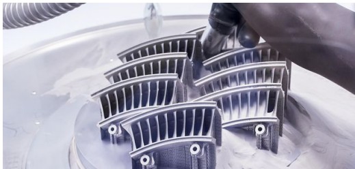
It takes just a few minutes to vacuum the excess powder off the part.