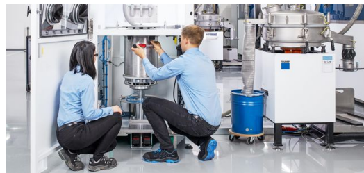
The construction cylinder is mounted in the unpacking station.