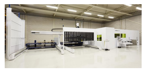
"Automating our machines eases the work for the employees. Instead of tedious and troublesome loading and unloading operations, they can devote their attention to other tasks during production operations," Sander Mutsaers explains.

"Even after this short period in use we have been able to reduce by 40 percent the time needed to manufacture the front panel of a pay-and-display machine, made of aluminum and stainless steel. The separate working phase at the press brake for small bendings is eliminated because the new punch laser cutting machine already takes care of the necessary bends," he tells us. Formed areas – like brackets, threads and hinges – are now made up quickly and easily on the TruMatic 6000 fiber. Four TRUMPF press brakes are used when processing larger parts and assemblies.