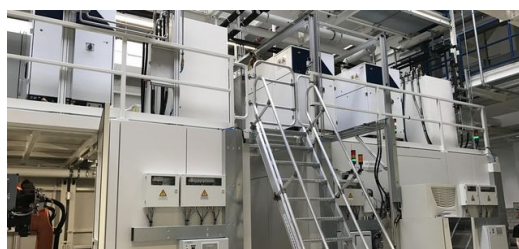
The CAMTRONIC section of the Mercedes-Benz plant in Berlin Marienfelde already fills more than one production hall. Production is organized as a linked flow line and is largely automated.

This approach was the only means of optimizing the processing speed for series production of the component while at the same time guaranteeing the even hardening of all surface areas. Another major challenge was that of optimizing the hardening parameters and managing the sequence of different hardening requirements, especially when processing the hard-to-access parts of the shift gate. It was important not to cause any damage to the part's surface or alter its dimensions beyond the defined tolerance limits because it cannot be machined after hardening. It is also imperative to avoid distortion effects that might cause the cam pieces to stick in the camshaft guide.