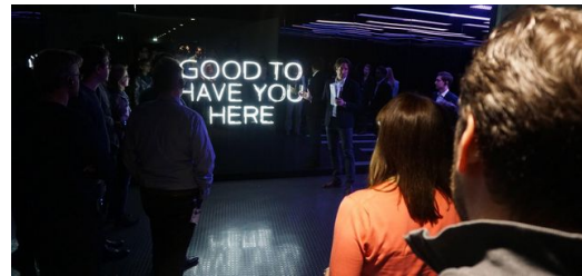
The words in the TRUMPF own tunnel system has been handcrafted exclusively for the company. Electrodes excite the gas in the tubes that form the words, making it light up.