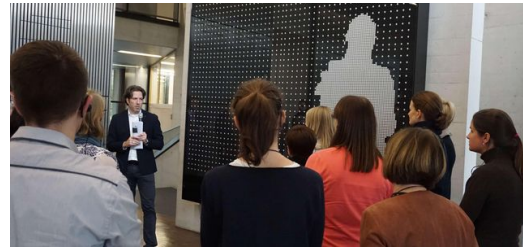
A good two dozen colleagues gathered in the lobby of the sales and service center to find out about the new Welcome Passage.