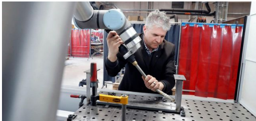
The TruArc Weld 1000 is the entry into simple welding for the company zweifel metall ag.